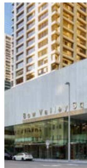
Your Office Tower