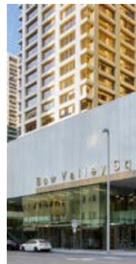
Your Office Tower