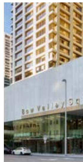
Your Office Tower