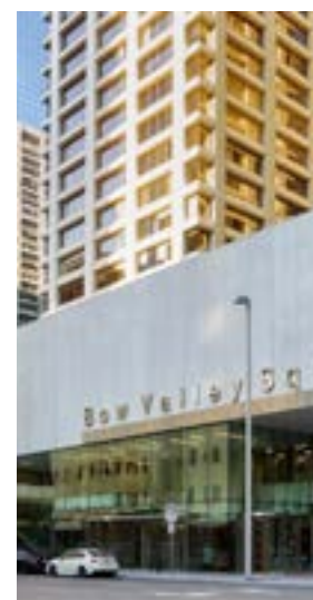
Your Office Tower