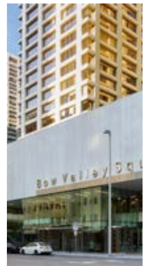
Your Office Tower