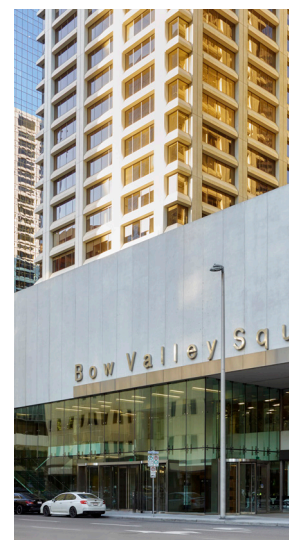
Your Office Tower