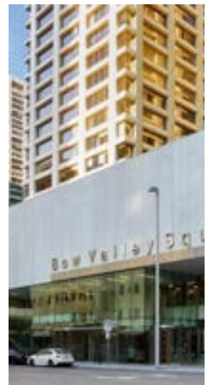
Your Office Tower