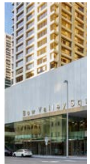
Your Office Tower