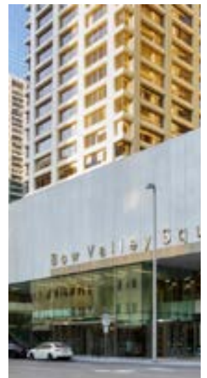
Your Office Tower