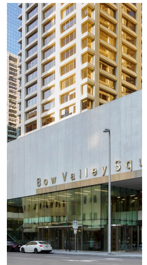
Your Office Tower