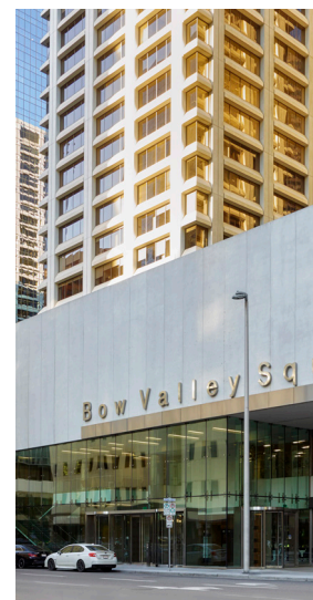
Your Office Tower