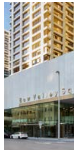
Your Office Tower