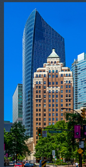
Your office tower, View From W Hastings St