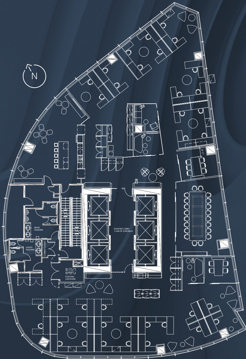
Plan view of your suite, Suite 2400, MNP Tower

Design innovation with waterfront views in the Central Business District. Blending old and new to spur innovation and balance, MNP Tower at Oxford Place is a striking modern skyscraper with a preserved historic facade. Located in Vancouver's business core, small and large businesses enjoy the waterfront views, social spaces and diverse office layouts. Easy access to transit makes MNP Tower a popular choice for leading companies.